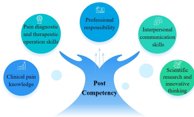
Figure 1. Five key dimensions of job competence in anesthesiology (pain diagnosis and treatment course).